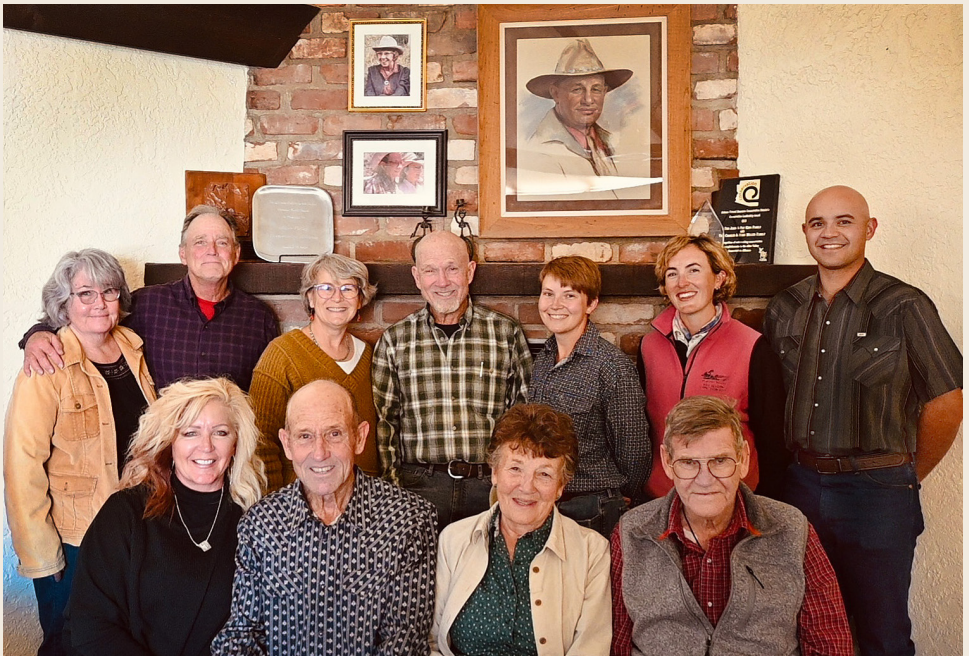
The Miller Family, March 2025